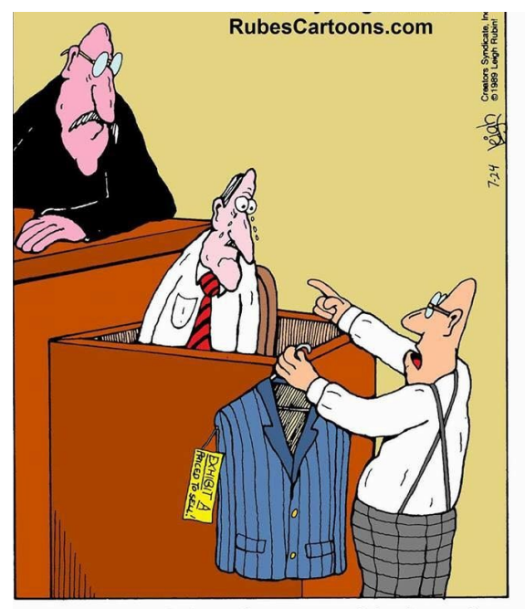
When pressed, the tailor, a material witness in the suit, came apart at the seams. His altered testimony completely unraveled. The tale he had woven had been a complete fabrication.