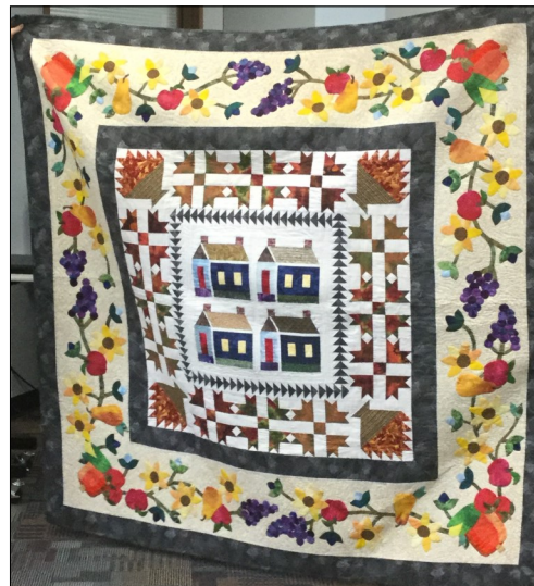
Just a few of the beautiful show-and-tells from last month's Guild Meeting. We certainly have very talented members.